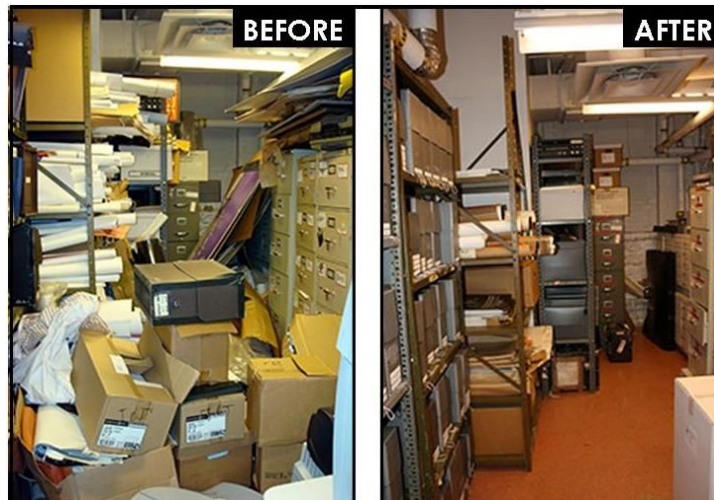
Pictured: Images of the Dance Theatre of Harlem archive room before and after an archive project.

Your legacy is important. As dancers, choreographers, and artists, we have a responsibility to document and preserve our art form for future generations. Even if you are at the beginning of your artistic career, the benefits of developing your archive include improving your organization's administrative efficiency, strengthening its self-knowledge, enhancing its public image, and contributing to scholarship and public education. The Artist's Legacy Toolkit will help you organize and preserve your materials in ways that are practical but neither time-intensive nor expensive. See below for guidelines on how to use the Toolkit depending on where you are in your career.